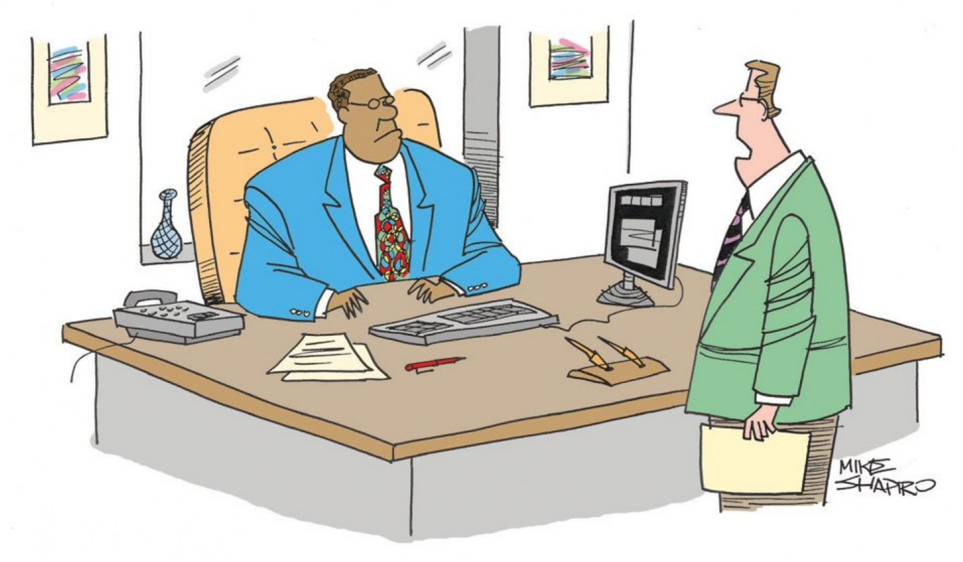
"All this talk about civility is interfering with my constitutional right to yell at my co-workers."