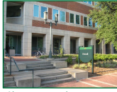
Alt text example: Fretwell building where DS is located