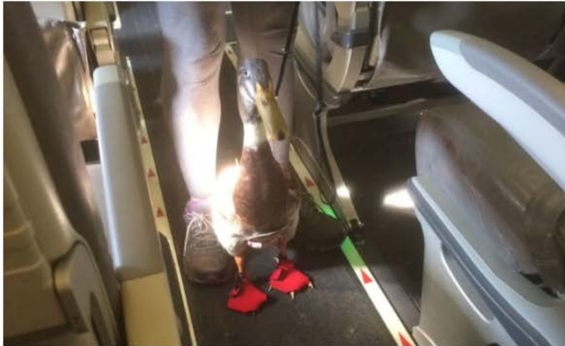
Daniel, an emotional support duck, on board a recent American Airlines flight.